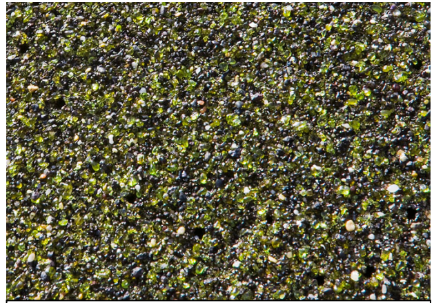
sand from the Green Sands Beach ...

Back in early spring of 2008, when Todd and I were living together on the Big Island, we took an early-morning trip to this beach -- a Peace-full adventure I remember quite fondly. We were the only two people there that morning, and we both took off all our clothes and sunbathed for a time on the soft, green sand.